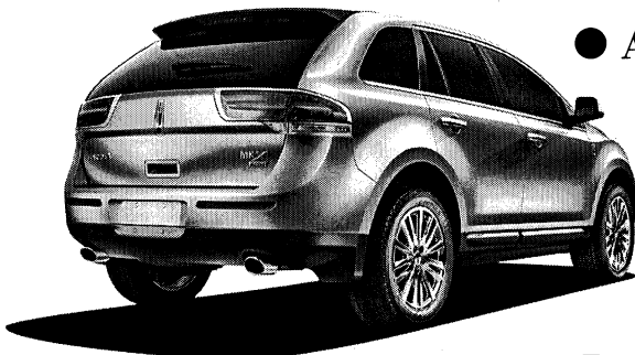
The 2011 Lincoln MKX